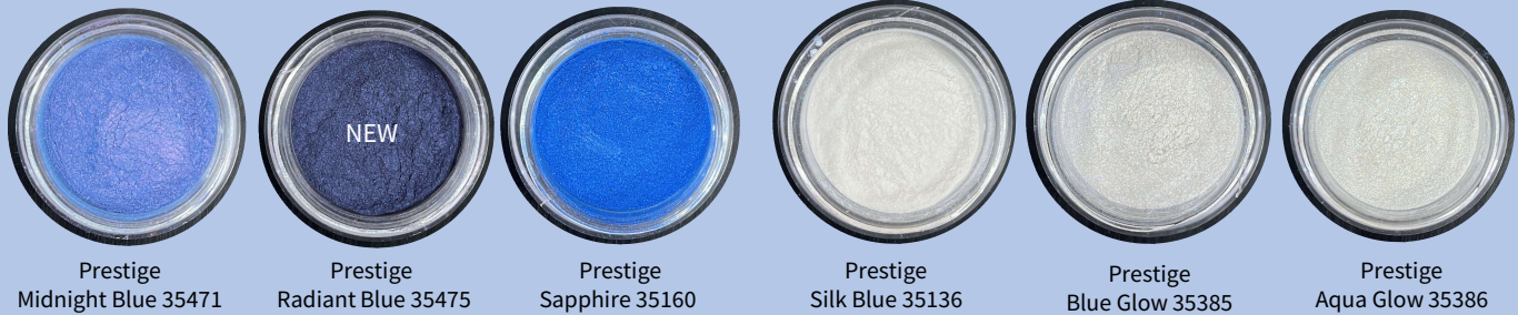
Prestige Midnight Blue 35471

Contact your regional Sudarshan sales representative today and let's elevate your formulations, together.