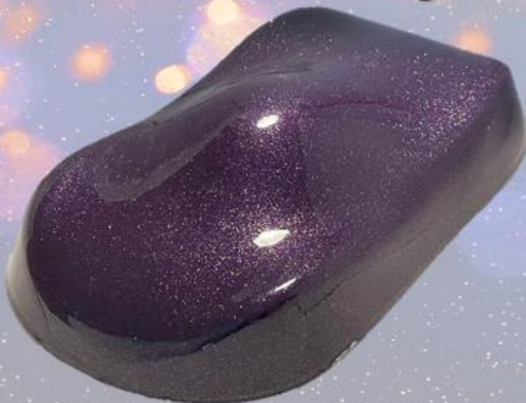
Solvent Based Polyurethane Base Coat with Tinted Clear Coat