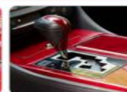
Sudaperm™ Red 2975K (PR 177)