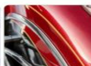
Sudaperm™ Red 2975C (PR 177)