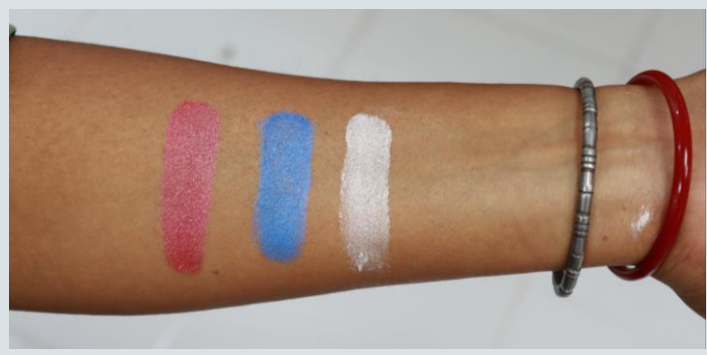
Hand application of Garnet Fire Red, Prestige Sapphire 35160 and Sumicos Silk Silver Mist SM122

Hooray for the USA, which celebrates its 245th anniversary of independence from Britain on July 4! Commonly celebrated with BBQ, fireworks, baseball games, parades, pool/beach parties – this is one of the favorite major, non-religious holidays (Thanksgiving being the other). Don't forget your sunscreen!