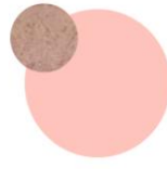
Impatiens Pink 13-1510 Prestige Ruby (35469) 16.6% Prestige Silk Gold (35132) 83.3%