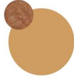
Oak Buff 16-1144 Sumicos Bronze (43737) 38.46% Prestige Gold (35145) 38.54% Prestige Silk Silver (35130) 23%